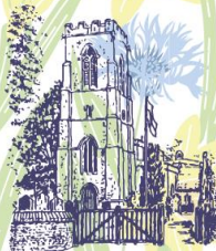
St Mary The Virgin, Welford