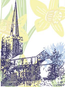
All Saints, Naseby