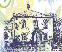
Welford Congregational Chapel