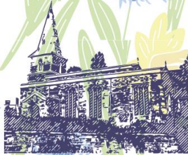
All Saints, Clipston