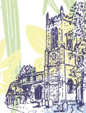
St Nicholas' Marston Trussell