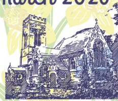
St Michael's Haselbech