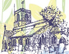
St Helen's Sibbertoft