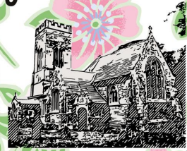
St Michael's Haselbech