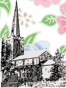
All Saints, Naseby