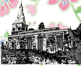
All Saints, Clipston