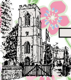
St Mary The Virgin, Welford