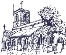
St Helen's Sibbertoft