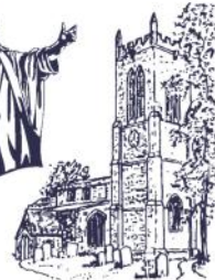
St Nicholas' Marston Trussell