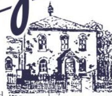
Welford Congregational Chapel