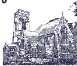
St Michael's Haselbech