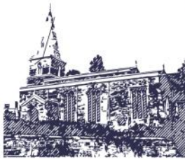
All Saints, Clipston