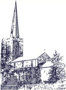
All Saints, Naseby