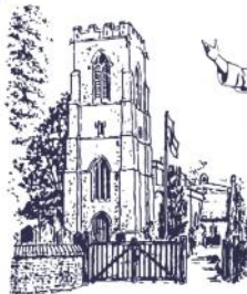
St Mary The Virgin, Welford