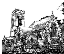
St Michael's Haselbech