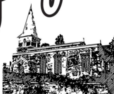
All Saints, Clipston