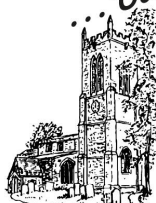
St Nicholas' Marston Trussell