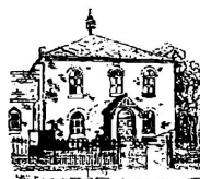
Welford Congregational Chapel