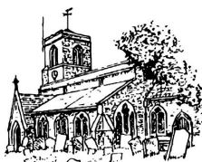
St Helen's Sibbertoft