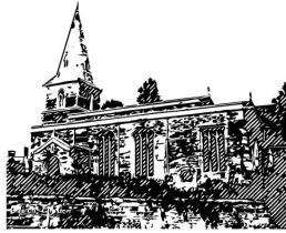
All Saints, Clipston