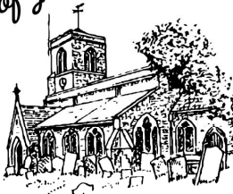
St Helen's Sibbertoft