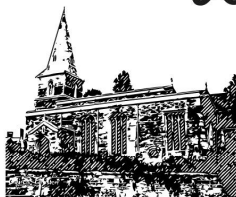
All Saints, Clipston