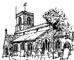
St Helen's Sibbertoft