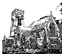
St Michael's Haselbech