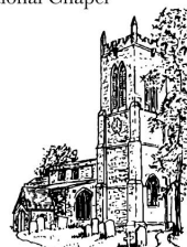
St Nicholas' Marston Trussell