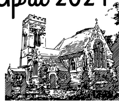
St Michael's Haselbeck