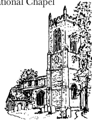
St Nicholas' Marston Trussell