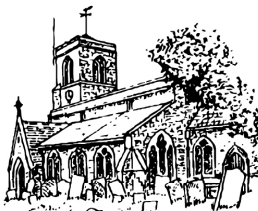
St Helen's Sibbertoft